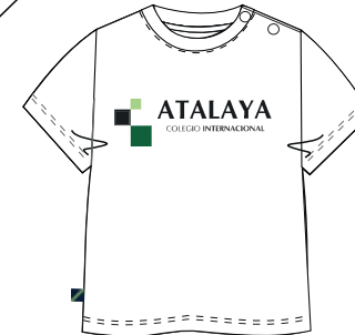
ROUND NECK (FOR PRESCHOOL SIZES)