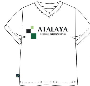
V-NECK (FROM PRIMARY)